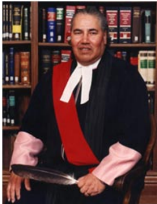
The Honourable Mr. Justice Murray Sinclair

Mr. Justice Murray Sinclair will be the Keynote Speaker at the 2003 CASHRA - the Canadian Association of Statutory Human Rights Agencies - Annual Conference to be held in Winnipeg this month.