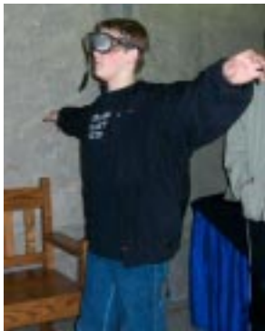
Both children and parents took part in experiencing the effects of alcohol at one of the many interactive booths on Law Day.