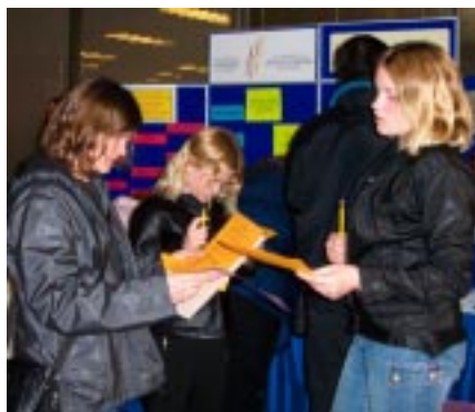
Many people stopped by the Commission's booth to take the Human Rights Quiz.

The Manitoba Human Rights Commission joined forces with the Canadian Human Rights Commission and set up a display featuring a human rights quiz and general information.