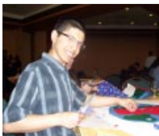
A Cross Lake School student enjoys the hands-on activity.

The "Peace by Piece" project allows students to send a message about human rights. The six schools that participated in this conference had only one hour to be both creative and thoughtful during the afternoon activity session. Working in school teams they talked, cut and pasted to create their portion of the banner which is estimated to be at least 24 feet by 24 feet when it is assembled.