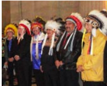
Many Manitoba Chiefs came to the Manitoba Legislature to honour and raise awareness of Treaties and their importance in the creation of Canada and Manitoba.

As part of the events for Treaties Day at the Manitoba legislative assembly, a sunrise ceremony was conducted in the morning on the legislative grounds, Treaty displays were showcased and a Treaty play was performed for visitors after the ceremonies in the Legislative Chamber.