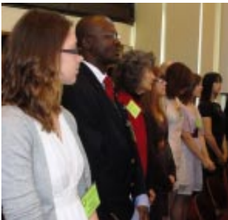
Students listen to the many guests and dignitaries at the inauguration ceremony.

In front of honoured guests and dignitaries, the first class of students who are enrolled in the Bachelor of Arts in Human Rights and Global Studies, embarked on the first steps of this unique degree. This interdisciplinary degree at the University of Winnipeg Global College is the first of its kind to be offered in Western Canada.